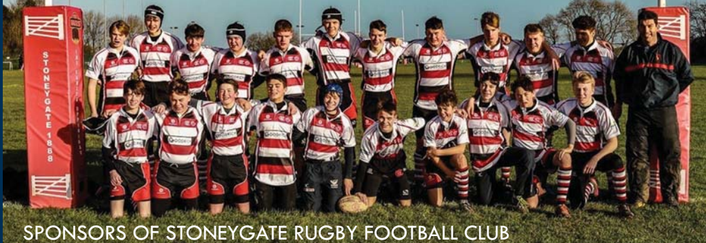
SPONSORS OF STONEYGATE RUGBY FOOTBALL CLUB

Goodrich Consulting LLP Malsor House, Milton Malsor Gayton Road, Northampton, NN7 3AB Tel: 01604 859859 www.goodrichllp.com Twitter: @Goodrichllp