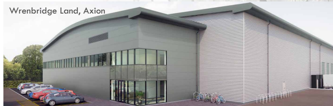
Wrenbridge Land, Axion

Axion is complete! The 65,877 sq ft warehouse completed in October 2018. The build went to programme and was helped by planning permission being approved within 5 months of the site being purchased. We are on site in Dartford on a new high specification warehouse scheme. The warehouse totals 45,000 sq ft with the individual units ranging from 8,500 sq ft to 13,500 sq ft. Also starting on site this year is Boxset Basildon and we are currently working on gaining a planning approval for Snodland with Wrenbridge Land.