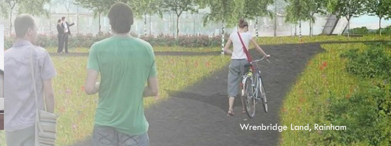
Wrenbridge Land, Rainham