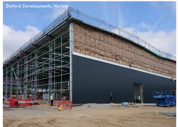
Stoford Developments, Harlow

We are very excited to be working with Stoford Developments as Project Managers and Quantity Surveyors on the design and construction of a five unit scheme totalling over 500,000 sq ft on an existing site in Harlow. The project is to be delivered in two phases. Phase 1, the Demolition of 2 existing redundant buildings, is currently underway and due for handover in the Summer of 2019.