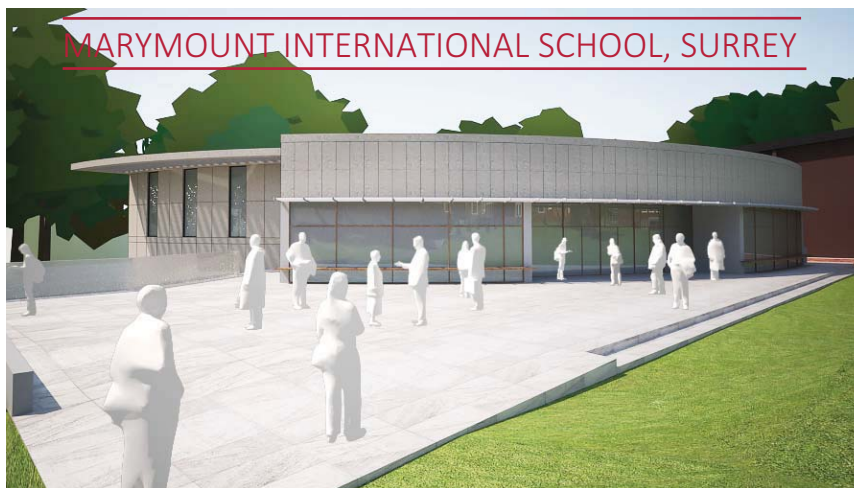
MARYMOUNT INTERNATIONAL SCHOOL, SURREY

Works will commence on the new Performing Arts Centre for Marymount International School, Surrey, in 2018. This state of the art performance centre will boast a 450 seat theatre with specialist lighting, audio visual installation, dance studio, music tutor room and two classrooms. We have been appointed as both Project Manager and Quantity Surveyor on this exciting new build for the School. This is our second project for the school.